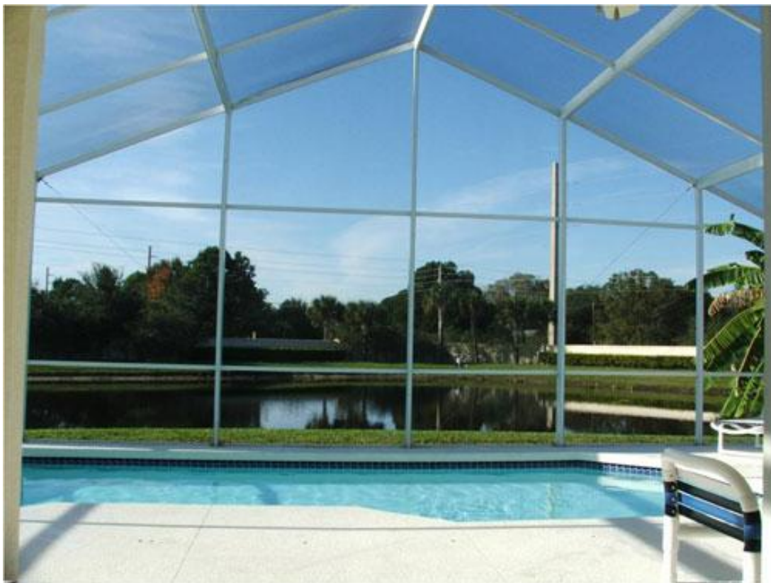
View from the main living room

A large westerly facing lanai ensures that you have the sun for most of the day but particularly in the afternoon until it sets – some wonderful sunsets can be seen from the lanai. There are wonderful views over the lake at the rear of the property, which as previously mentioned, is not surrounded by houses and gives a tranquil setting to see the amazing wildlife which lives on and around the lake.